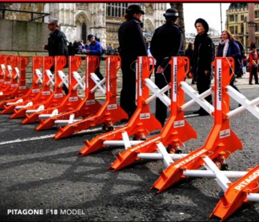
PITAGONE F18 MODEL

PRESENT IN OVER 40 COUNTRIES WORLDWIDE, PITAGONE DELIVERS ITS PATENTED SOLUTIONS ON THE FIVE CONTINENTS.