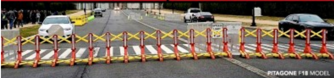
PITAGONE F18 MODEL