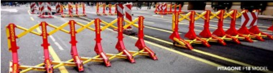
PITAGONE F18 MODEL