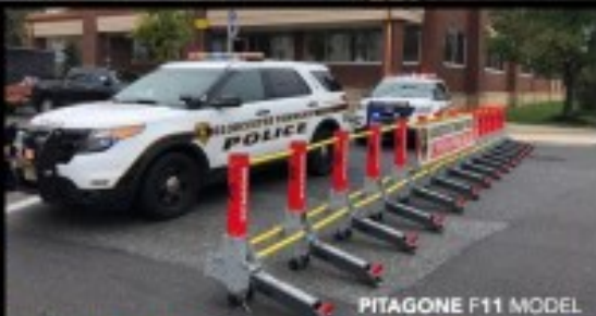
PITAGONE F11 MODEL