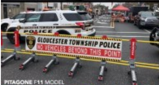
PITAGONE F11 MODEL